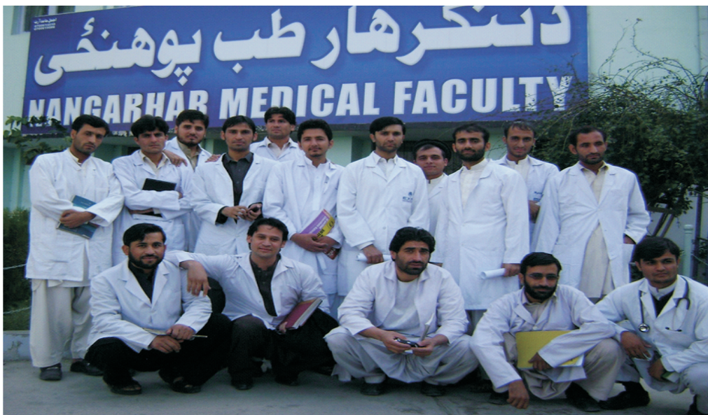
د ننگرهار د طب پوهنځی د پنځم صنف محصلین، ۱۳۹۰