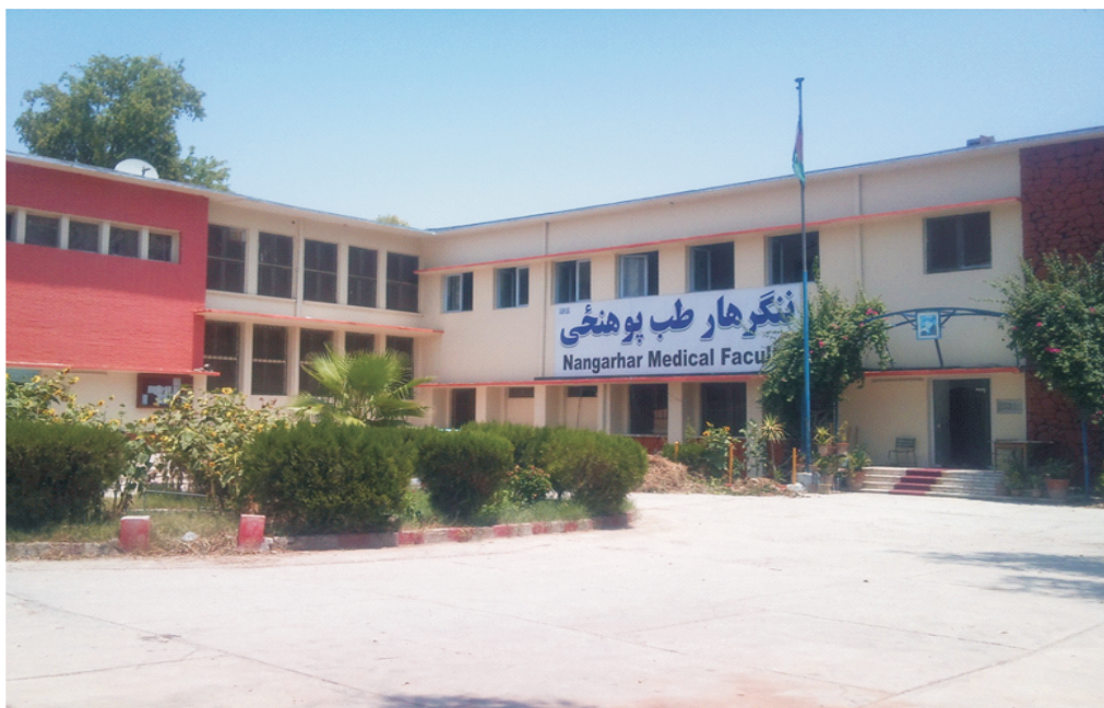
د ننگرهار د طب پوهنځی ودانۍ، ۱۳۹۱