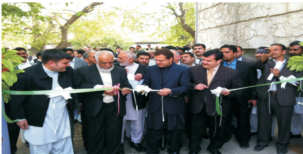
د ننگرهار پوهنتون د نوی لیلیې د افتتاح مراسم