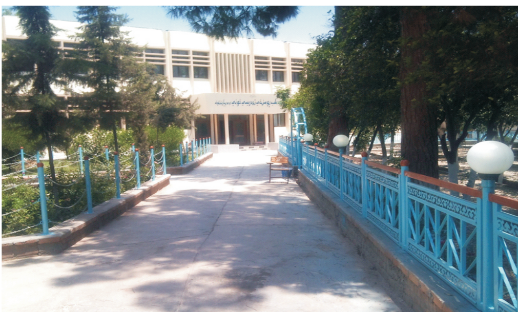
د ننگرهار د طب پوهنځی تدریسی خونۍ، ۱۳۹۲