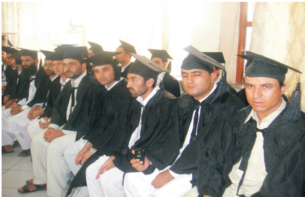
د ننگرهار د طب پوهنځی د محصلینو د فراغت مراسم، ۱۳۹۰