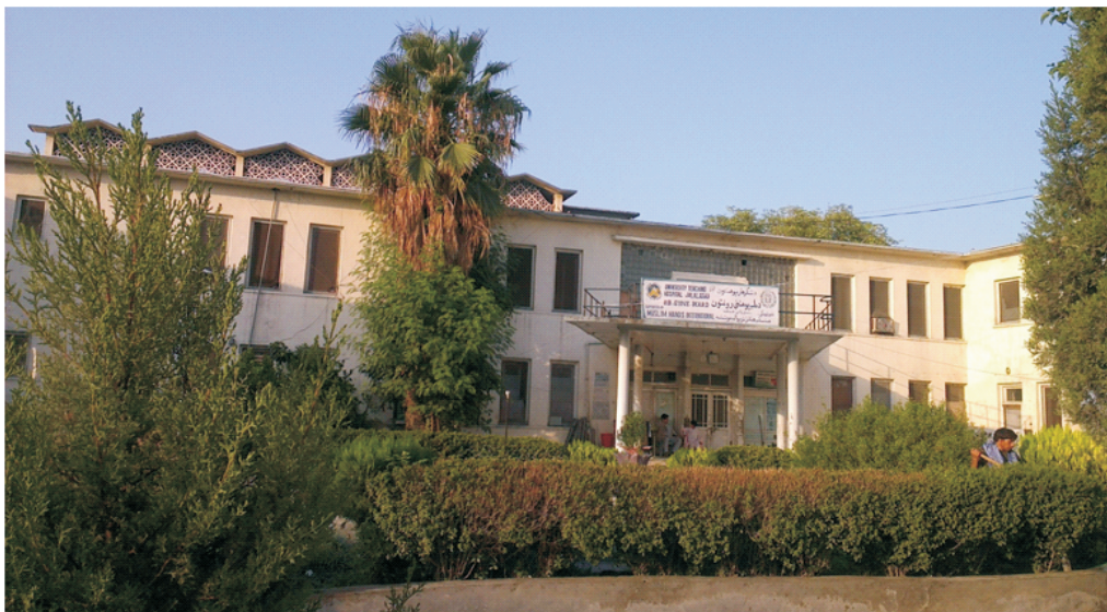
د طب پوهنځی تدریسی روغتون، ۱۳۹۲